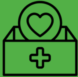
Continuity of care