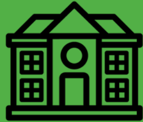
Guaranteed access to high- quality early learning