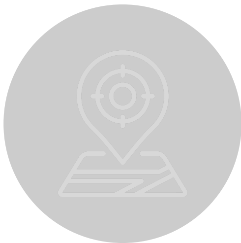
SESSION ONE Understanding the System