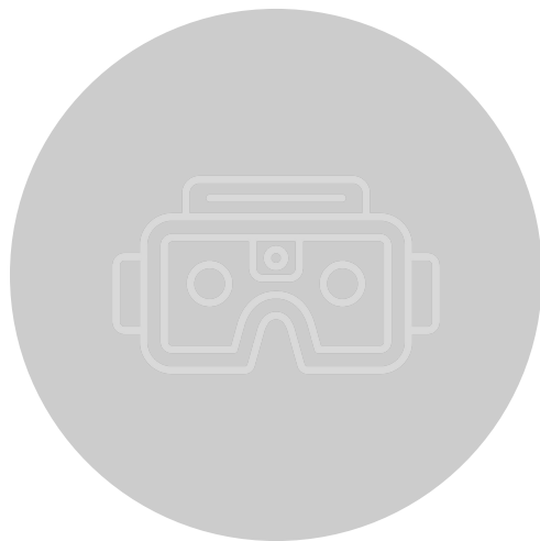
SESSION TWO Future Framing