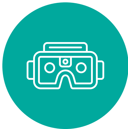
SESSION TWO Future Framing