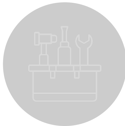
SESSION THREE Prototyping